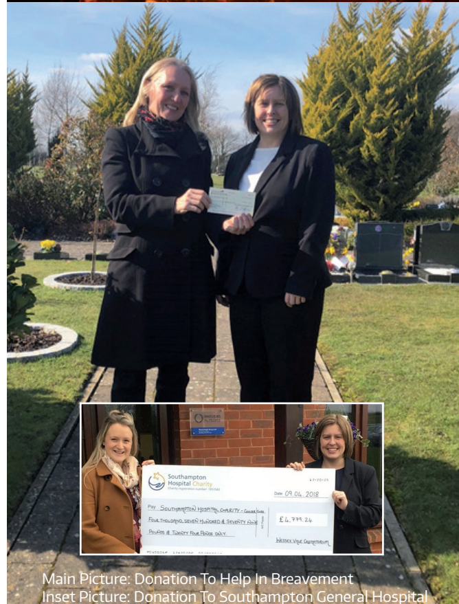
Main Picture: Donation To Help In Bereavement Inset Picture: Donation To Southampton General Hospital